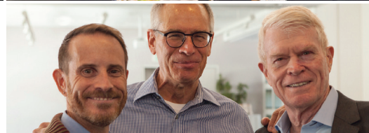
Guests at ESC's Volunteer Recognition Luncheon